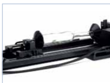
Cylindrical engraving device