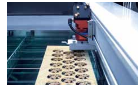
Cutting table with aluminium or acrylic bars