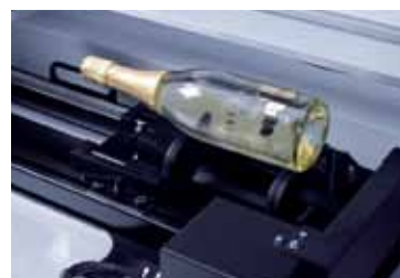
Cylindrical engraving device