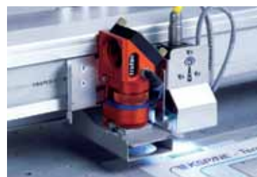
Vision system i-cut®